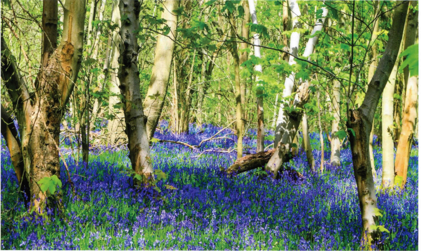
The wonderful display of bluebells in our wood this year